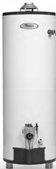
Hot Water Heater